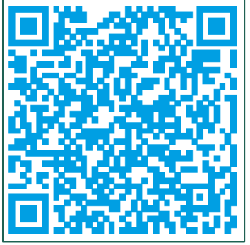
Cladding & Decking inspiration storaenso.com/cladding