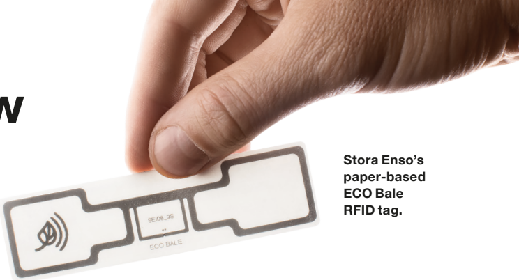
Stora Enso's paper-based ECO Bale RFID tag.

The Hammer System, in operation, will do (1) quality control of the tag (2) automated removal of under-performing tags (3) tag encoding (4) encoding data transmission to the selected database (5) tag encoding verification by integrated RFID reader and (6) tag application to the bale unit.