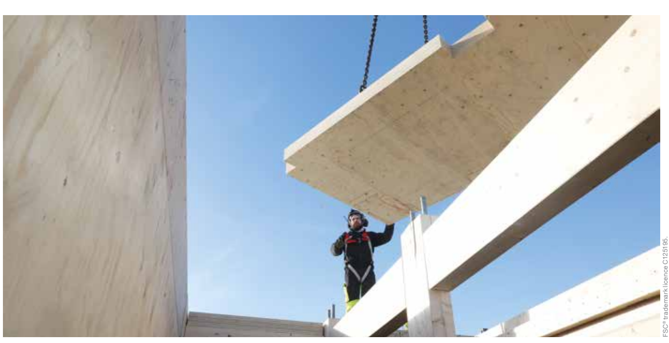
Contact your nearest Stora Enso sales person and ask for further information