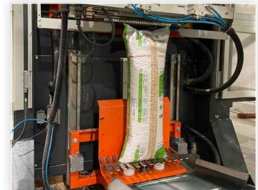
16 kg Pellet Bag