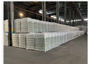
16 kg Pellet Bags